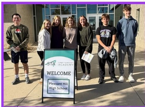
PHHS students attended a tour at Summit Technology Academy. PHHS sends students each year to complete capstone programs at STA.