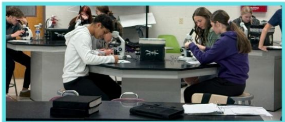
Students in Mr. Thompson's Biology class have been studying the structures of the cell. In the lab, using microscopes they looked to see different cells and identify structures within.